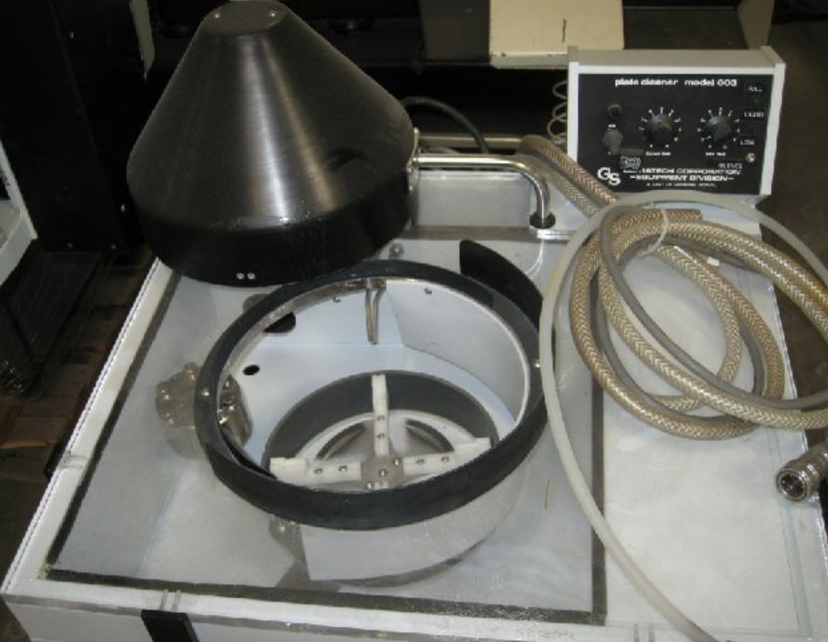
plate cleaner model 603